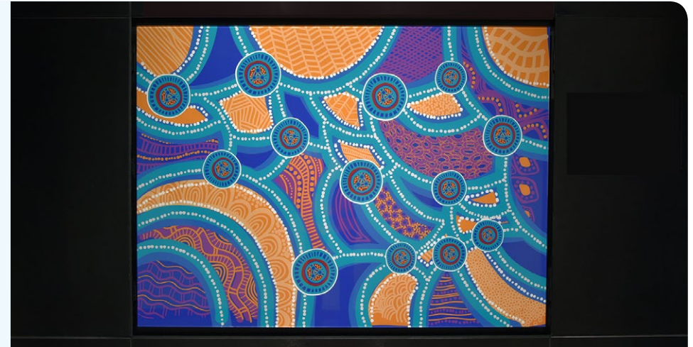
Above: We are proud to display our RAP artwork in a custom-built installation in our reception area.